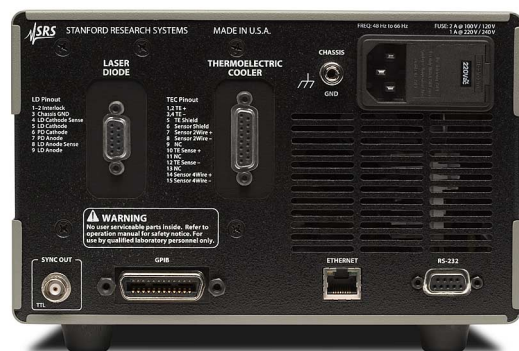
LDC501 Rear Panel

The LDC501 has an auto-tuning feature which automatically optimizes the PID loop parameters of the controller. Of course, full manual control is provided too. Dynamic transfer between CT and CC modes for the TEC is also easy — just press the Temp/Current button.